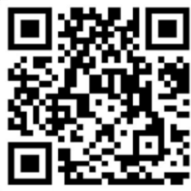
DAMINI LIGHTNING App

MAUSAM, a Mobile App of the India Meteorological Department (IMD) is providing seamless and user-friendly access to weather products available on https://mausam.imd.gov.in/. Users can access